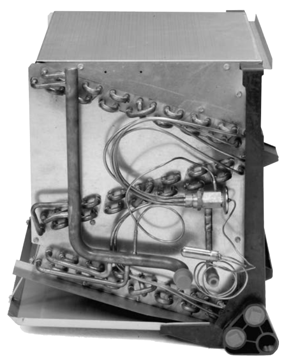
NOTE: Shown with Horizontal Drip Shield. (Requires RXHH- Horizontal Adapter Kit.)